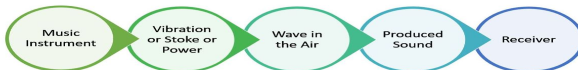
The process of Sound Production Figure – 1

For music, the music instruments are the source of the sound. When a stroke or power or vibration is placed at the vibrating parts of the instrument, the generated sound travels through the air and hits with eardrum and lastly, the sensation of sound is felt by the receiver. The following shows the process of sound production in music.