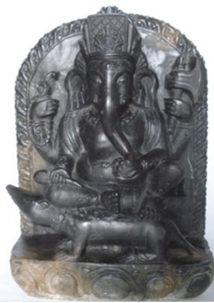
Fig.1 Chandra Shyam Dangol. Ganesh, 2014

The combination of images and symbols in mythical narrative appear strange and magical but they have underlined significance. They may be metaphors of abstract ideas. The interpretations of composition depict the close link with lived experience of the people. They are about the hope of happiness, fear of the unknown, protection from danger and adjustment in the context. Myths and artworks are interconnected. The magical characters and events in myths guide the community to a meaningful existence. The magical aspects in arts also have underlined significance related to spirituality and human existence in the world. Creative artists may unconsciously employ magical and mythical images and icons that signify a wider spiritual and cultural context. In this paper, the concept of myths and magic is used as a tool to analyze his stone sculptures.