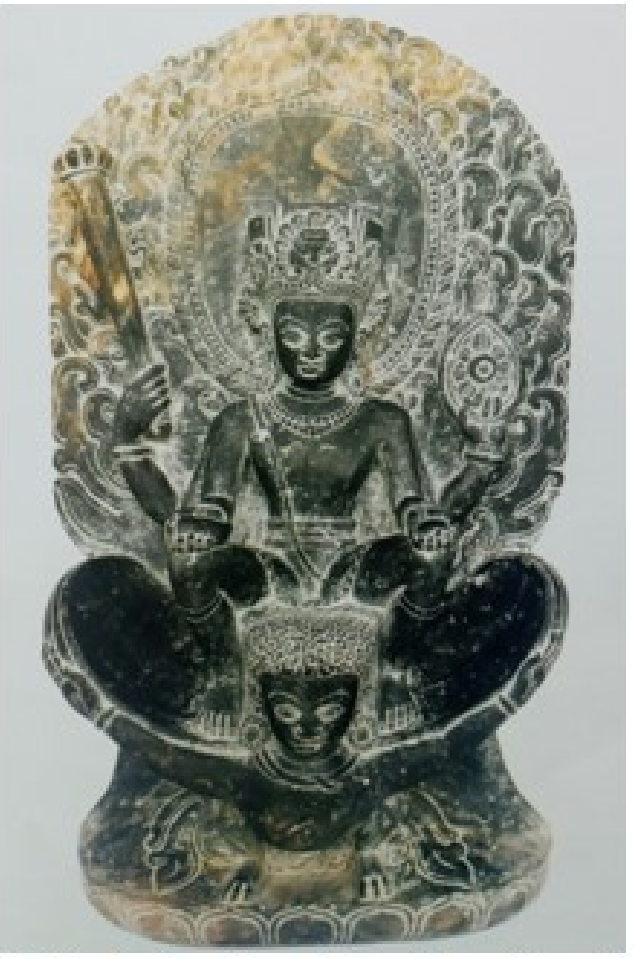
Fig.2 Chandra Shyam Dangol. Garudashan Vishnu, 2016

divine figures stand or sit on the lotus flower. This is a magical feature in the sense that the flower is small and soft, and it is almost impossible for the big and heavy figure to stand on it. It is mystical but it has another layer of meaning. Lotus symbolizes purity and enlightenment. This suggests that the divine figures are enlightened. Gaurda (bird) is the vehicle of Lord Vishnu. It is strange that the bird carries the load of Vishnu and flies in the sky. The mouse is the vehicle of Lord Ganesh. Some deities have multiple hands. This is also magical. It signifies that the divine characters can perform multiple tasks at once. This part of the article analyzes the artworks and interprets them in terms of their magical properties and their significance.