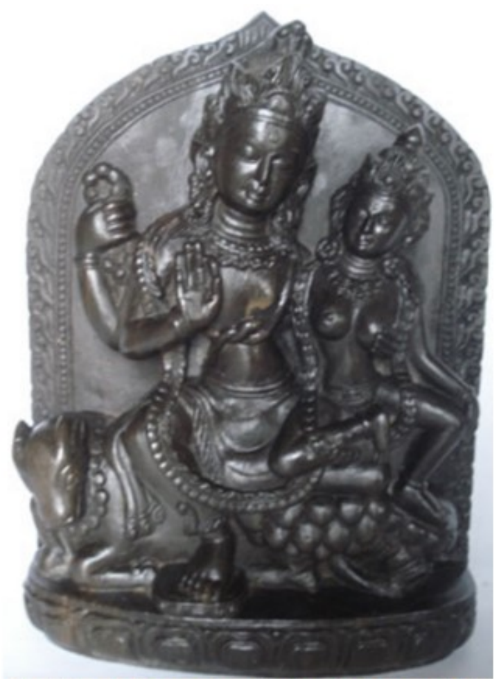
Fig.3 Chandra Shyam Dangol. Uma-Mahesvara, 2018

body is the hybrid form of the elephant's head and the human body. This strange combination signifies the existence of both aspects within a person. He has a garland of snake signifying that negative and positive aspects cannot be separated with clarity and distinction. They coexist in the same space. The composition of the symbols in the sculpture signifies the ethical and spiritual values like wisdom, enlightenment and the values of the society. On the surface, the work appears magical but it has underlined logic and convincing significance. (Shakya, 2000).