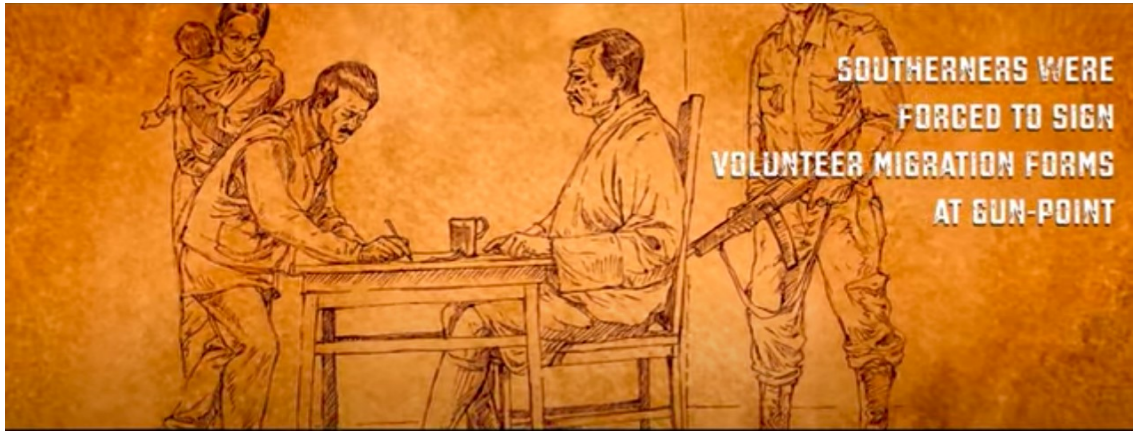
Figure 2 A scene along with a bicycle scene tells the history of the citizens leaving Bhutan in the movie -4:22-4:25.

proving southerners left Bhutan of their own free will (3:22-4:36). The bicycle scene presents how the history of the Lhotshampas intricated loyalty to the Bhutanese nationhood and why they were forced to leave the country.