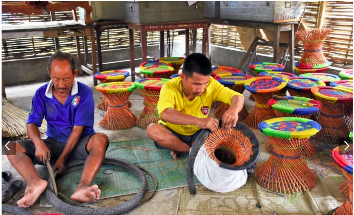
Figure 6 Hard at work, older refugees with disabilities make bamboo chairs using local materials in Beldangi settlement in Nepal

Parts of the bicycles were effectively reused. For instance, refugees with disabilities in the camps would get engaged in various income-generating activities. As Deepesh Das Shrestha (2020) shows, "One of them was making traditional stools ( muda ) using bamboo sticks, colorful nylon threads and used bicycle tyres (Shrestha, 2020).