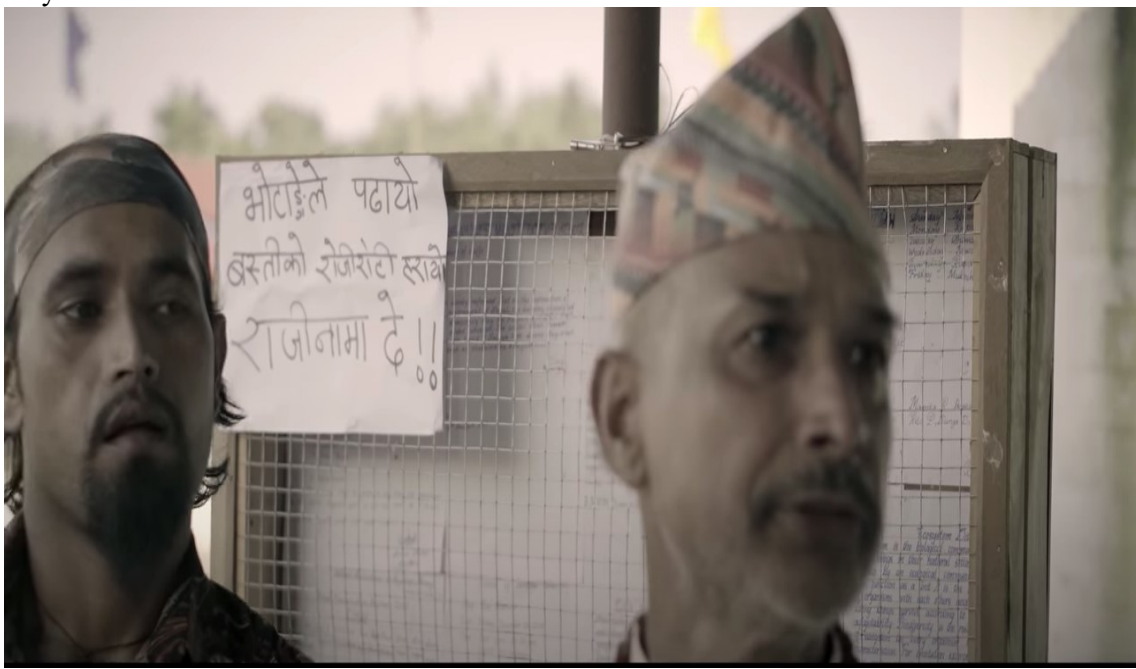
Figure 4 (The two antagonist characters, the priest as her father and the motorbike boy as one side lover appear in the school with a plot to make him resign- 6:09-6:11).

The law did not allow the refugees to work outside the camp. The matrimony and relations between refugees and locals were hardly accepted. Casteism was/is highly practiced within and outside the refugee camps. Their relationship could not be accepted despite the fact that they both were teachers, the educated persons. The motorbike boy makes a plot to expose their relationship as an issue in the school. By taking help of her priest father, the motorbike boy is successful to provoke the issue that the refugees are prohibited to work as they minimize the local's opportunity. In the school a poster was put with a slogan, "Bhotaange in our school taught, local's opportunity lost." Bhotaange is a derogatory term to address Bhutanese refugees among the locals. He has no option than drive back home on his bicycle.