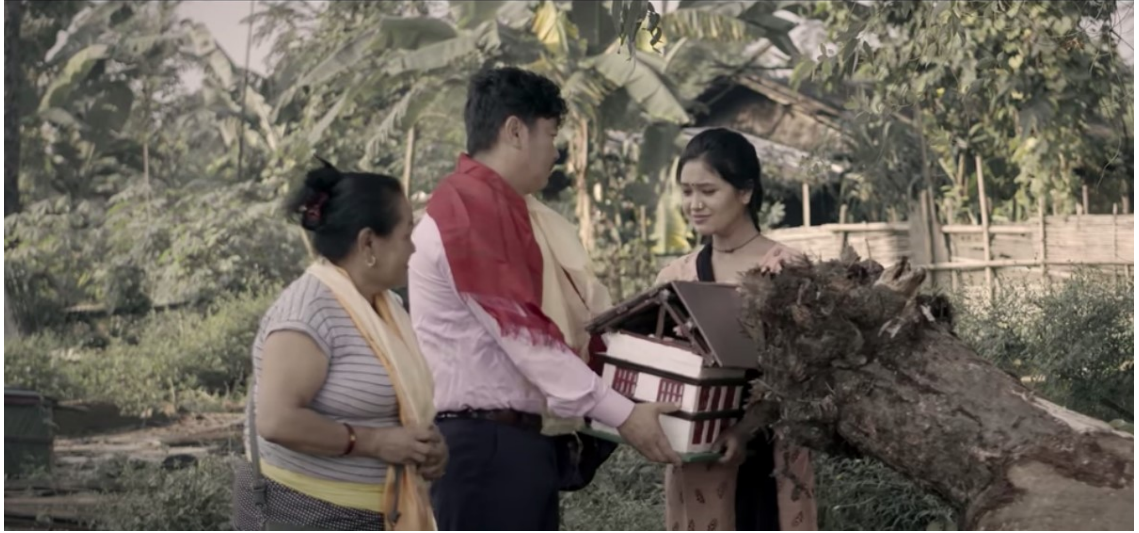
Figure 5 Gifting a model house while leaving the camp to his beloved Kanchhi with a promise of living together at the end -8:06-8:12

Kanchhi looks at him from a distance while he was marching towards the IOM bus. He turns away from the bus and marches towards Kanchhi with his Amu, takes out the mud from Bhutan and put it on Kanchhi's parting. They got married in the open theatre-like scenario; the motorbike boy is helpless. The short musical movie ends with the words, "Love and relationship cannot be refugee."