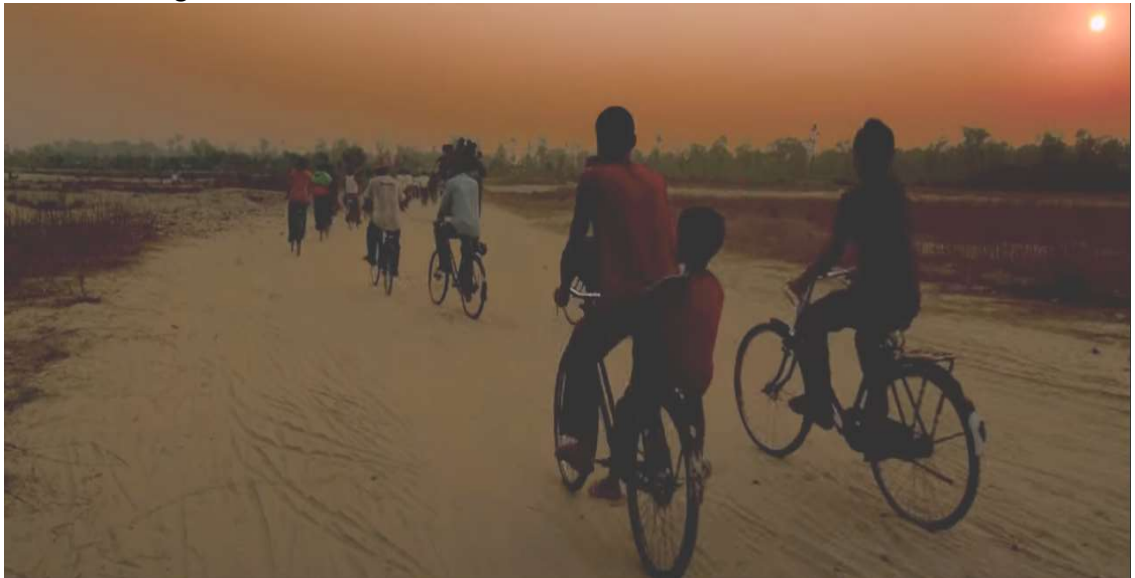
Figure 1 Thousands of Bhutanese refuge would go out of the camps early in the morning and return to their huts in the evening through bicycles before they left Nepal for third country resettlement 5:14-6:30

lifestyle of the Bhutanese refugees during the conflicting time of resettlement. There was resistance for and against the resettlement from the camp people. The struggle for repatriation was weakening.